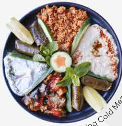
Sharing Cold Meze