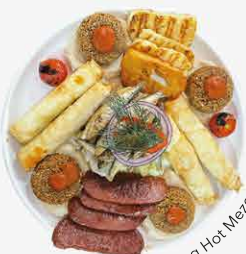
Sharing Hot Meze