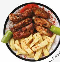
Ribs and Wings