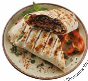
Mixed Shawarma Wrap